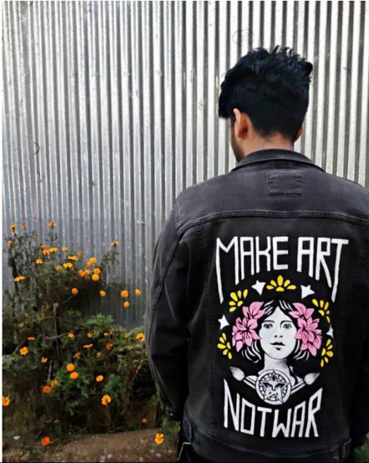
Art courtesy Dhritiraj Kalita