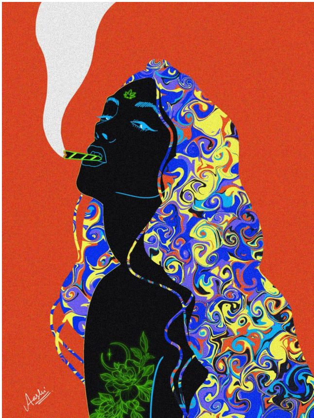
Art courtesy Akshita Choudhary