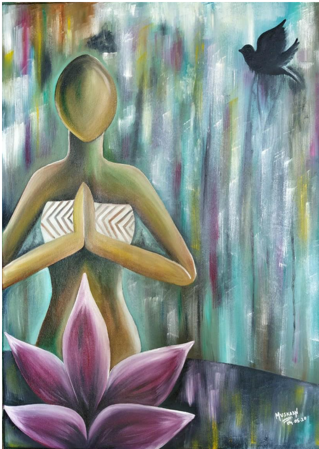
Art Courtesy Muskaan Arora