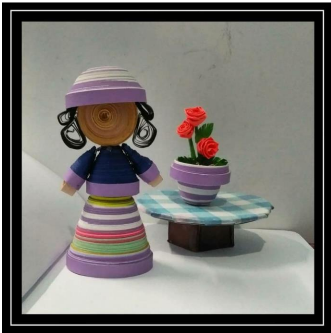
Art courtesy Aastha Khare