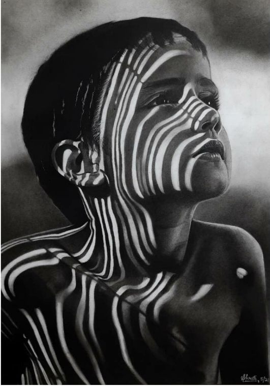
Art courtesy Shruti Aggarwal